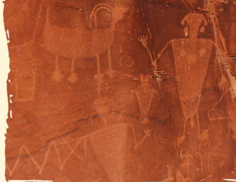
Dry Fork Petroglyphs

Flaming Gorge was established in the early 1960's after the Bureau of Reclamation built Flaming Gorge Dam. Situated 20 miles north of Vernal this area offers many recreational opportunities including camping, hiking, biking, water sports and fishing. There are two visitor centers, the Red Canyon Visitor Center and the Flaming Gorge Dam Visitor Center. Historic sites open to the public include the Swett Ranch and Ute Mountain Lookout Tower. Visit www.utah.com/nationalsites/flaming_gorge.htm or call (435) 784-3445 for information.