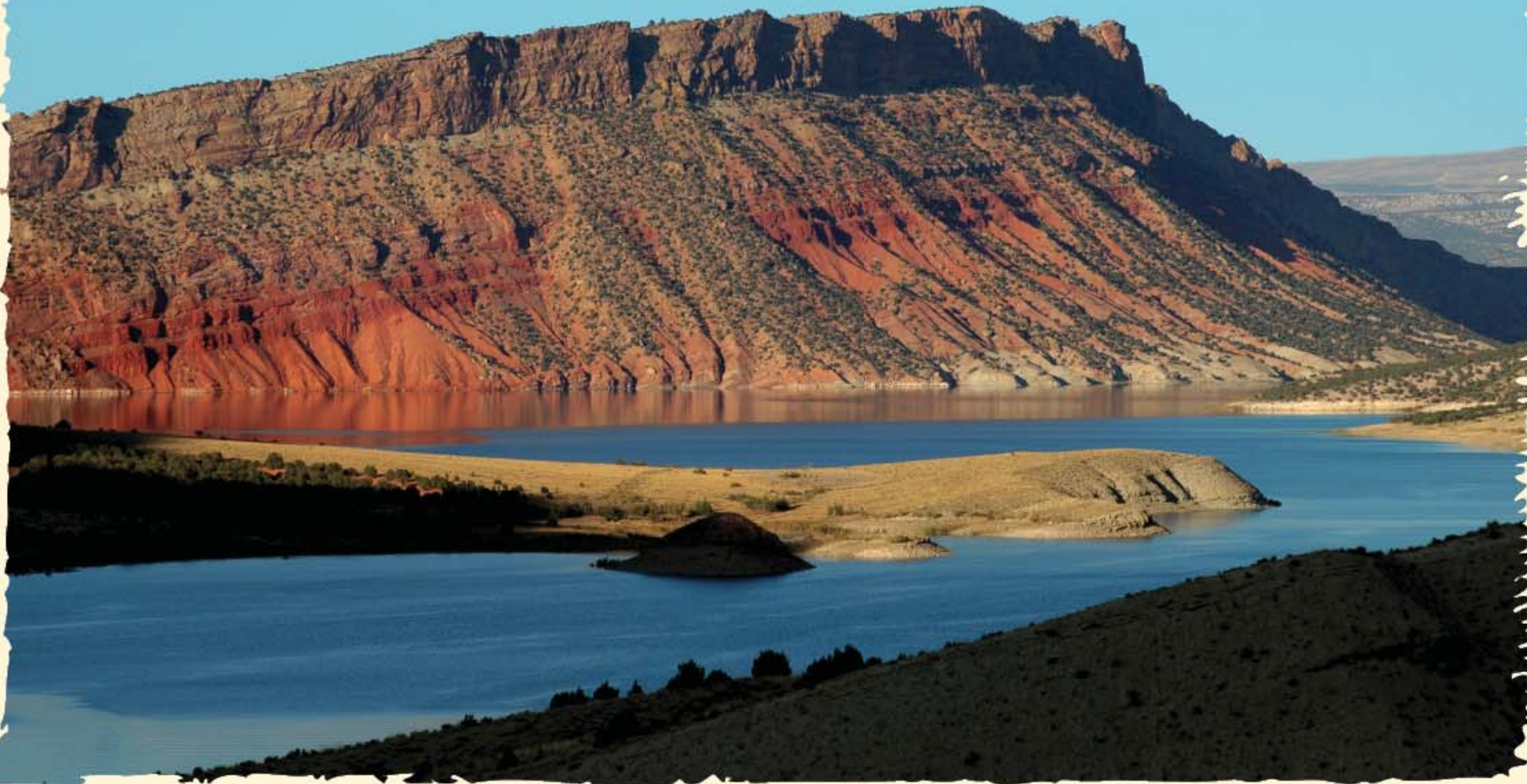
Sheep Creek Canyon, Larry Hansen

The cultural history of Dinosaur National Monument dates back 10,000 years and its 210,000 acres are ready to be explored. View fossils and exhibits at the temporary Visitor Center near the Quarry Visitor Center or take the Fossil Discovery Hike (approx. 1.5 miles round trip) and